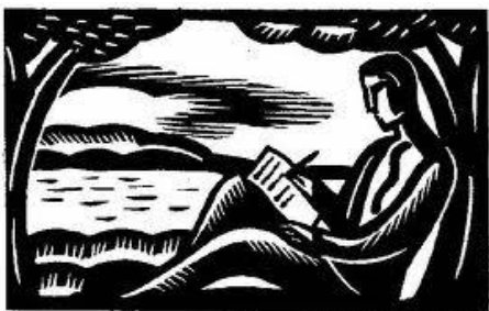
ILLUSTRATION BY ANTHONY RUSSO

This workshop, which will be offered as a monthly learning session at WISR, is designed to help you overcome whatever blocks or difficulties interfere with your writing. It will include discussion of the obstacles to writing you're experiencing, engage participants in exercises designed to inspire creativity and productivity, and help deepen your understanding of what's getting in your way. It will also provide practical tools and strategies to get the writing to flow.